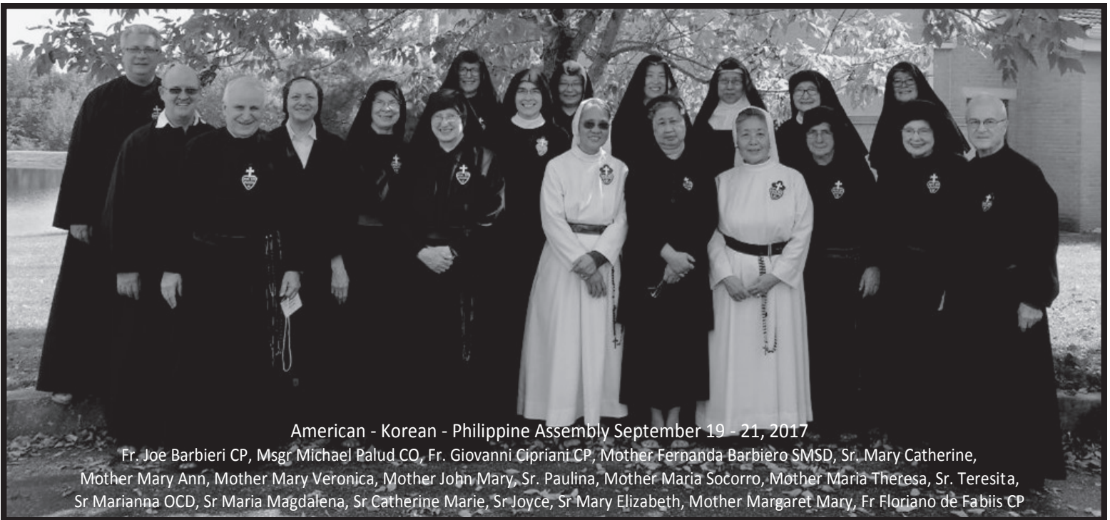
American - Korean - Philippine Assembly September 19 - 21, 2017