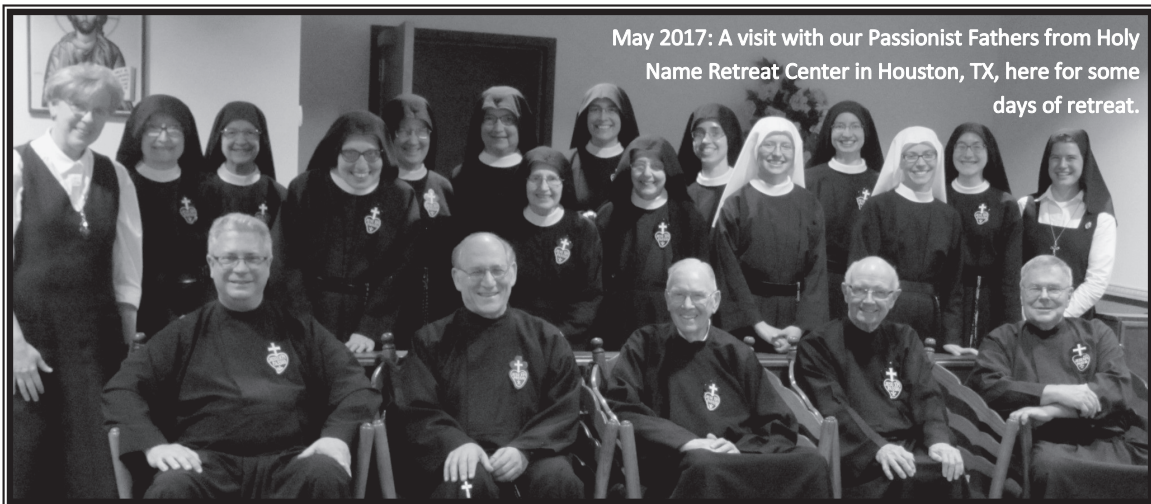
May 2017: A visit with our Passionist Fathers from Holy Name Retreat Center in Houston, TX, here for some days of retreat.