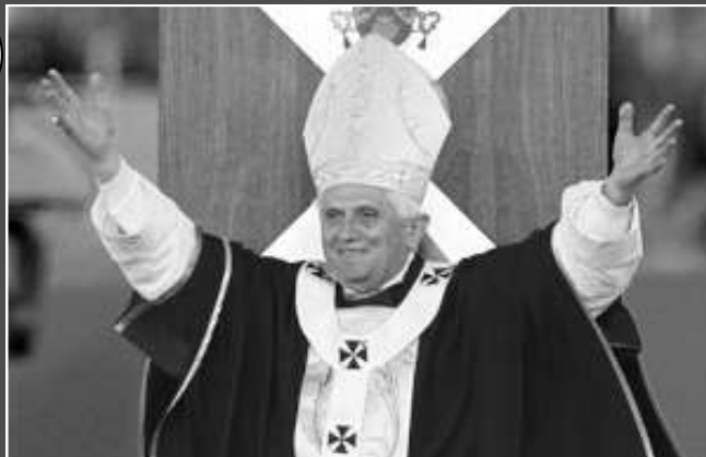
Pope Benedict XVI greets the participants of World Youth Day in Sydney, Australia